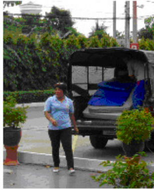
Rachawadee Girls staff