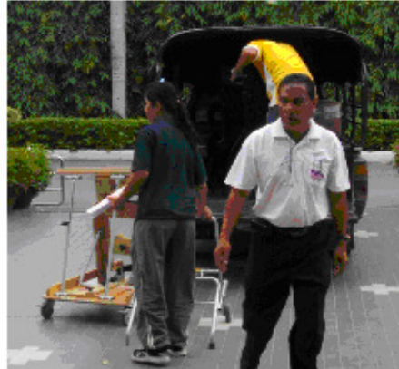
Nonthapoom home staff