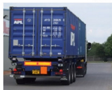
and departed on it's big adventure.