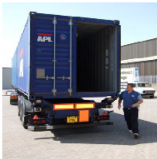
The container arrived... was filled...