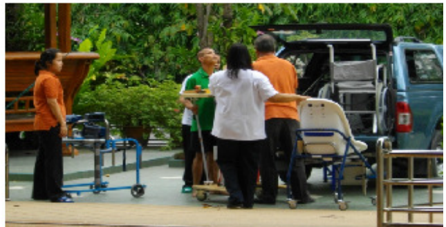
Rachawadee Boys staff